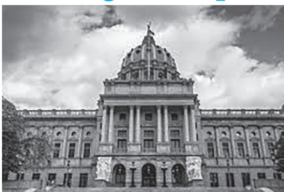
Pennsylvania state house

In Pennsylvania, for instance, our legislation overwhelmingly passed the House during 2017-2018 with no major opposition, unfortunately, time expired on the legislative calendar. When the legislation was reintroduced to the current