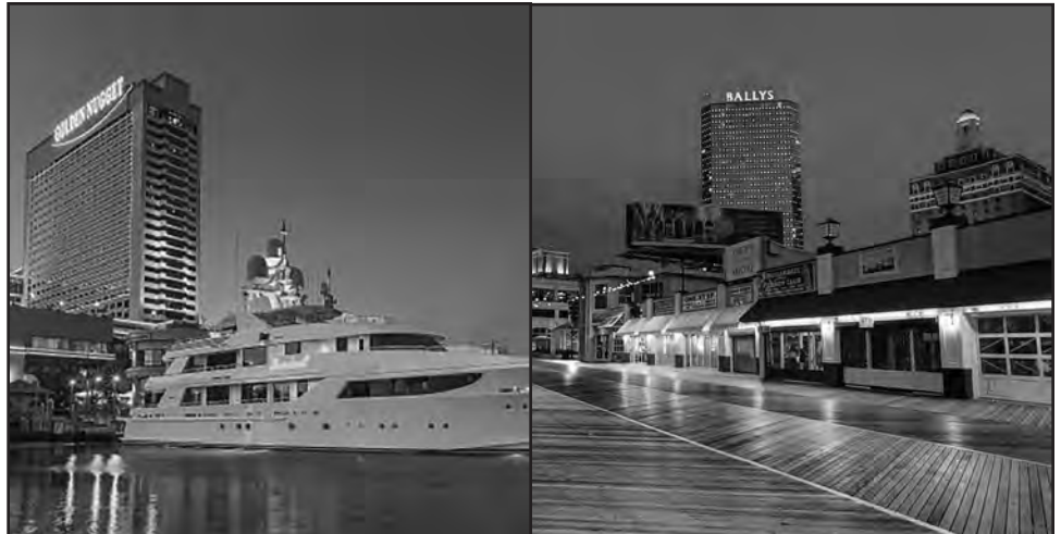
The beautiful harbor-marina of the Golden Nugget and the Atlantic City boardwalk, at night.

This year we pushed the date of the annual meeting back by about one